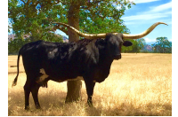
TOUCHDOWN OF RM